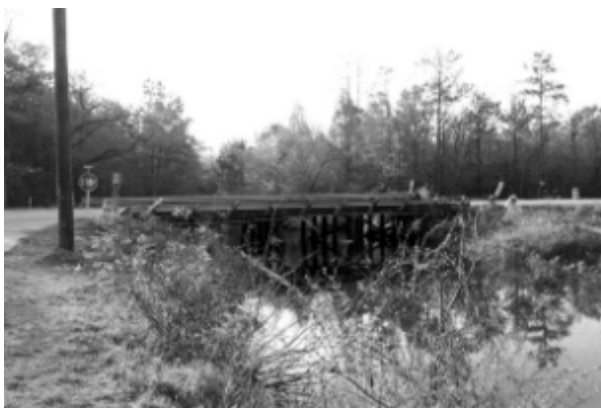
The bridge at French Quarter Creek. Brabant's Plantation and the historical marker are to the left