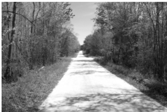
Santee River Road looking east from the bridge gives the feeling of how remote most places were during the War.

Watson engaged his cannon to dislodge the Patriots by using grapeshot. The grapeshot did its job and Watson was able to cross the swamp and continue his march toward Kingstree. The battle at the Kingstree Lower Bridge on the previous page was Watson's next encounter with Marion.