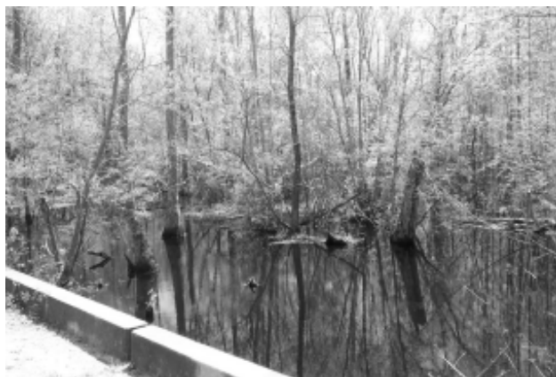
Mount Hope Swamp viewed from the bridge