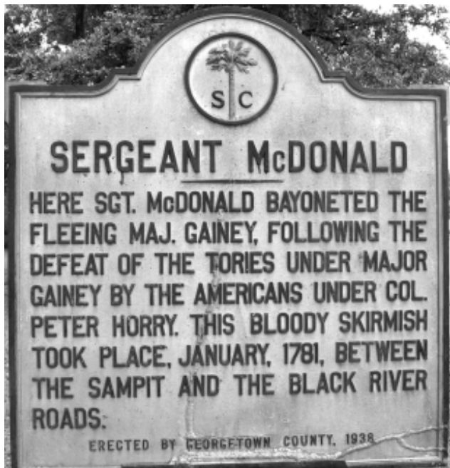
Sergeant McDonald's Marker at #5

Note: The two above actions probably happened along the Sampit or Black River Roads as Marion maintained his camp in Camp Swamp between the two roads.